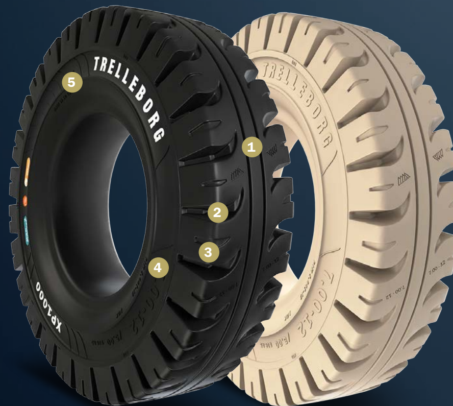
Patented pattern design